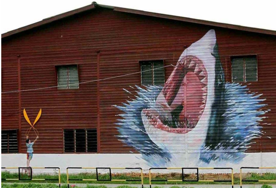
Chow Chin Chuan's Fish and Release .

“The villagers have evolved from knowing nothing about art to being involved in the art circle ... they have contributed their time and energy in promoting art in this fishing village. They have allowed artists to paint on their walls and they let out their rooms and houses for artists to stay in during the festival.”